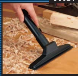
1 1/4" x 10" COMBO NOZZLE WITH SQUEEGEE