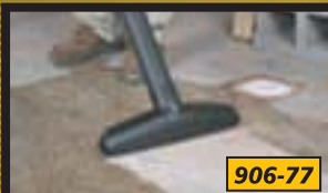
14" Floor nozzle with squeegee insert